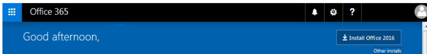
Fig 1: Screen example: